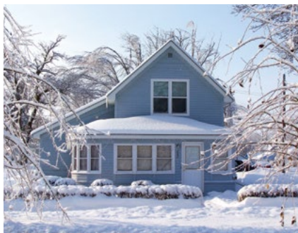
The Cold Weather Rule helps existing consumer-members maintain electric services during the winter.

Under the rules of both organizations, individuals who are unable to pay their bill and would like protection under the Cold Weather Rule must call Twin Valley's office at 866-784-5500 to make a payment arrangement. To remain protected by the Cold Weather Rule, the