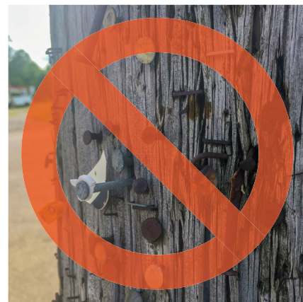
Attaching signs to power poles creates serious safety hazards.

The nails, staples and other materials used to attach items to a wooden utility pole can cause the pole to deteriorate more quickly, reducing its structural integ-