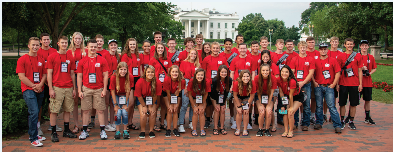
Thirty-nine delegates from Kansas and Hawaii stand in front of the White House during their tour of Washington, D.C., July 7-14.