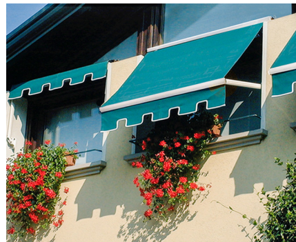
Fabric window awnings can be retracted up against the wall to expose the window glass when more light is needed indoors.

Adjustable awnings can be tilted at different angles throughout the summer or the rest of the year as the position of the sun changes. This allows you to install the same awning style on many windows to provide a consistent exterior appearance while still varying the amount of shading for each. Look for strong aluminum frame designs that lock well into the various positions. Flimsy