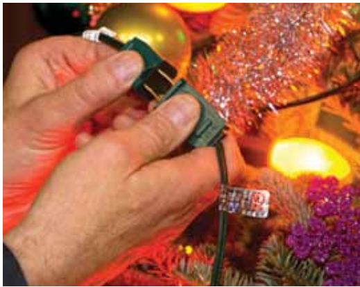
Check to make sure connections are secure and cords are not worn or frayed.

When decorating outside, make sure outdoor outlets are equipped with ground fault circuit interrupters (GFCIs). Check that all items and extension cords are marked for outdoor use. And exercise extreme caution when decorating near overhead power lines. Use a wooden or fiberglass ladder instead of metal. Keep yourself