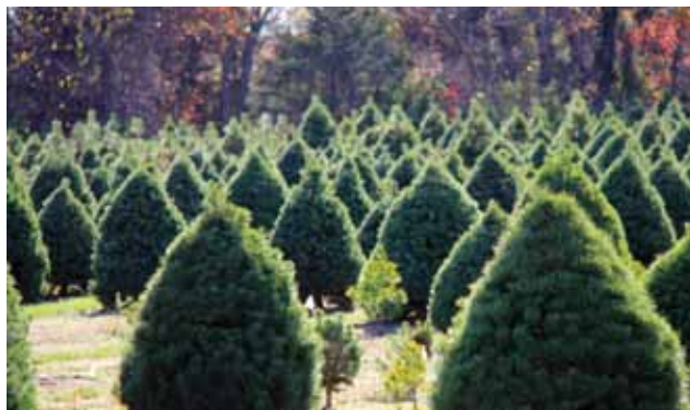
There are nearly 2,000 trees from which to choose this season at McConnell Christmas Tree Farm.

Over the years, the amount has grown to nearly 2,000 living trees. In 2006, they started selling a modest amount of trees and now are selling over 100 per season. They offer three types of pine trees: Austrian, Scotch and White.