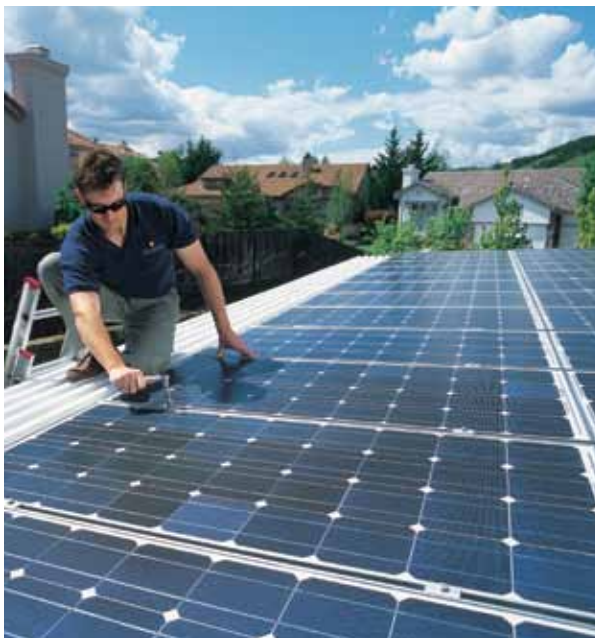
A solar system produced only 409 kWh per month, making the approximate payback on a solar system 84 years.

Both systems were total failures in less than 10 years. In fact, nearly all of the systems failed in less than 15 years. I thought there must be a better way.