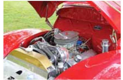
Under the hood is a 350 Chevy engine.

'39 Ford won as the "Rod & Custom Magazine's Editor's Choice" for "Cute N' Chubby" out of roughly 3,000 other cars in Snowmass, CO.