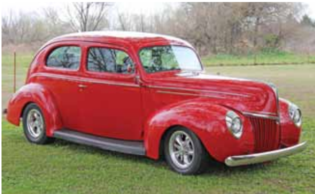
The 1939 Ford Deluxe Sedan after restoration.