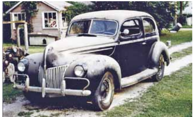
The 1939 Ford Deluxe Sedan before restoration.