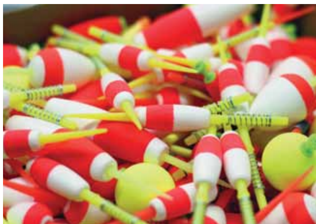
Big Hill Bait Shop is within the store also and carries live bait such as: minnows, worms, goldfish, liver and a full line of fishing tackle.