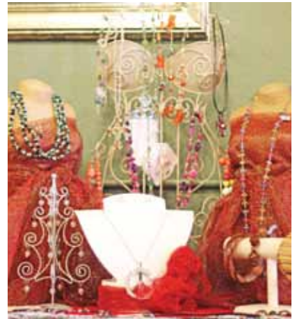
Co-op Connections Card carriers can receive 10 percent off beautiful items like these.

Twin Valley Electric is always looking for interesting hobbies or businesses to feature for the Community Spotlight. If you or someone you know would like to participate, please contact Twin Valley Electric at 620-784-5500.