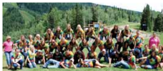
Kansas delegates will attend Cooperative Youth Leadership Camp July 9-15, 2011.