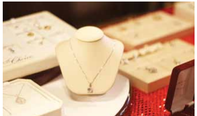
Parsons Fine Jewelry, offers a wide variety of diamonds, gemstones, costume and fine jewelry.