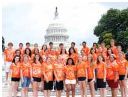
Students from Kansas join more than 1,500 youth in Washington, D.C., this year's Youth Tour is scheduled for June 9-16, 2011.

and return the application below to Twin Valley, PO Box 368, Altamont, KS 67330.